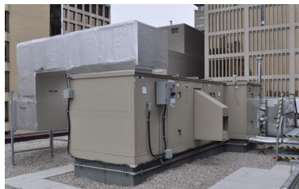
PHOTO-CATALYTIC OXIDIZING (PCO) technology converts and neutralizes Volatile Organic Compounds (VOC), odors, fumes, and toxic chemicals to benign water and carbon dioxide by-products. The process is called heterogeneous photocatalysis or photocatalytic oxidation. In chemistry, photocatalysis is the acceleration of a photoreaction in the presence of a catalyst. In photo-generated catalysis the photocatalytic activity depends on the ability of the catalyst

to create electron-hole pairs, which generate free radicals (hydroxyl radicals: \cdot\text{OH} ) able to undergo secondary reactions. Its comprehension has been made possible since the discovery of water electrolysis by means of titanium dioxide – \text{TiO}_2 . \text{TiO}_2 is a semiconductor photocatalyst with a band gap energy of 3.2 eV. When this \text{TiO}_2 is irradiated with the photons of less than 385 nm, the band gap energy is exceeded and an electron is promoted from the valence band to the conduction band. The resultant electron-hole pair has a lifetime in the space-charge region that enables its participation in chemical reaction. The most widely postulated reactions are \cdot\text{OH}^- + \text{h}^+ \rightarrow \cdot\text{OH} (hydroxyl radical) and \text{O}_2 + \text{e}^- \rightarrow \text{O}_2^- (super-oxide ion). Hydroxyl radicals and super-oxide ions are highly reactive species that will oxidize volatile organic compounds adsorbed on the catalyst surface. Commercial application of the process is called Advanced Oxidation Process (AOP). There are several methods of achieving AOPs that can, but do not necessarily involve \text{TiO}_2 or even the use of UVC irradiation. Generally the defining factor is the production and use of the hydroxyl ion. (in part from Wikipedia).